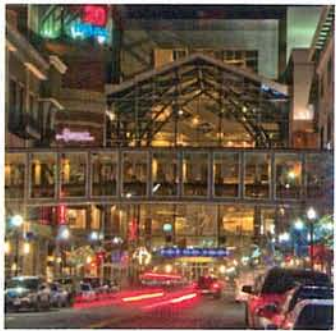
Weekend in downtown Spokane, page 32