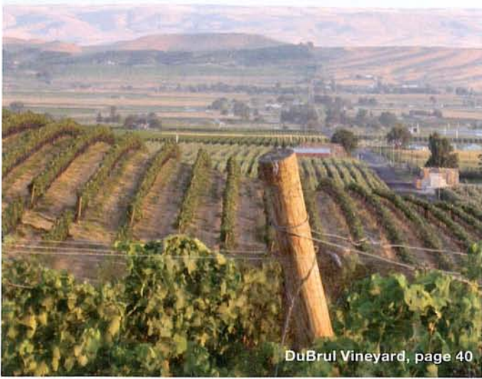
DuBrul Vineyard, page 40