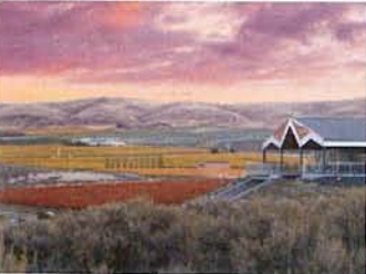
Top 10 Picnic Spots, page 18