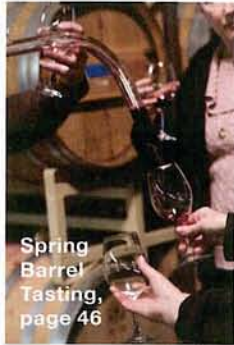
Spring Barrel Tasting, page 46