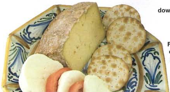
Farmstead cheese, page 38