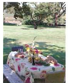
On the Cover Tom Douglas' farm in Prosser, page 28